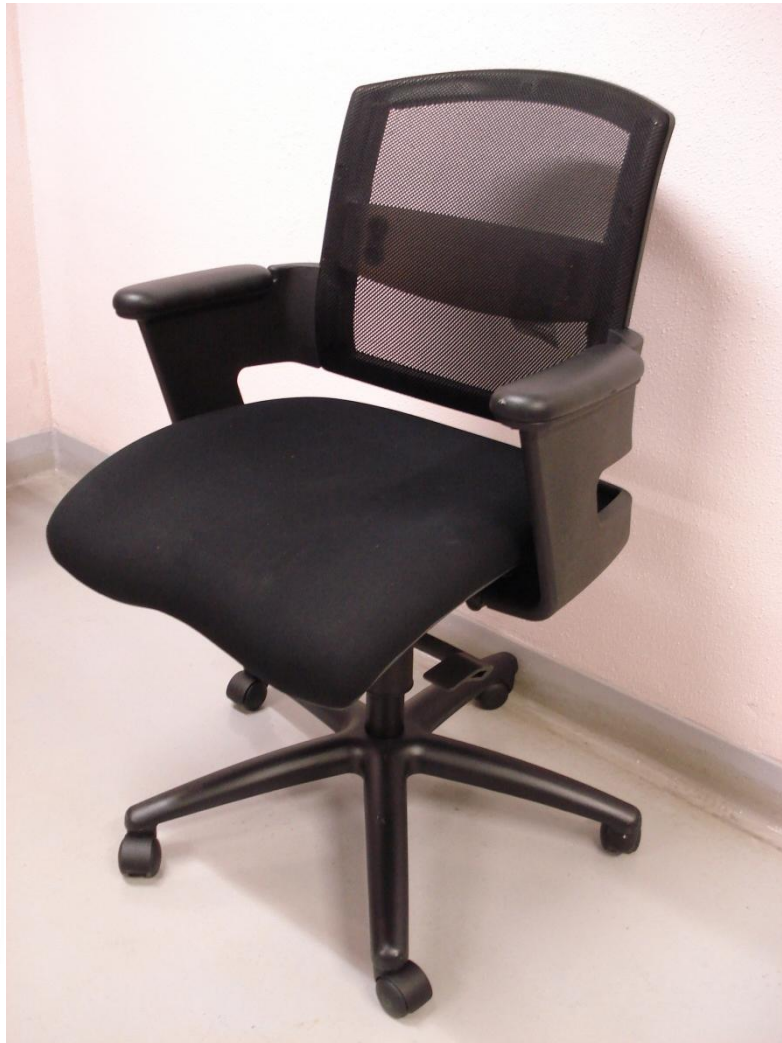
Photograph 1 : Wing