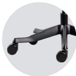
Black Epoxy Aluminium (VB)