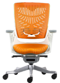
White 708W MB G65 VG Black 708B MB G65 VB