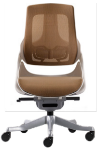
White 608W MB A00 VG Black 608B MB A00 VB