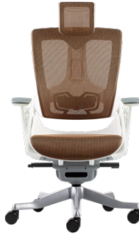
White 709W MB G65 VG Black 709B MB G65 VB