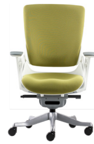
White 708W MB G65 VG Black 708B MB G65 VB