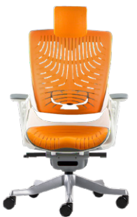
White 709W MB G65 VG Black 709B MB G65 VB