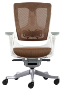
White 708W MB G65 VG Black 708B MB G65 VB