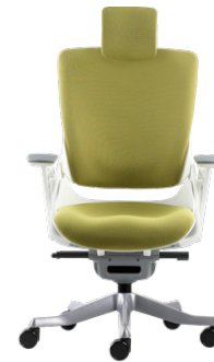
White 709W MB G65 VG Black 709B MB G65 VB