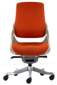
White 608W MB A00 VG Black 608B MB A00 VB