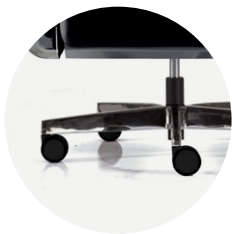
350 Chrome Aluminium Base (NC)