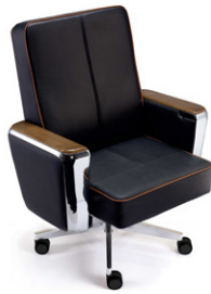
687B YA A68 NC