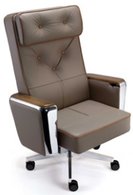
689A YA A68 NC