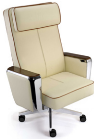
689B YA A68 NC