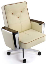
687A YA A68 NC