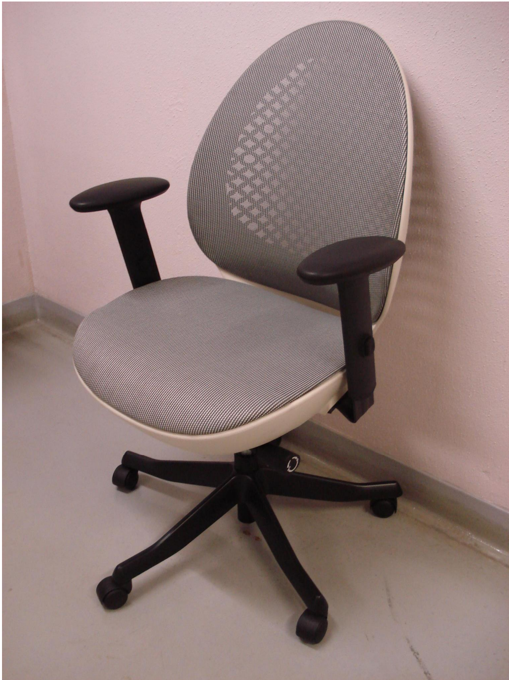
Photograph 1 : Ovo