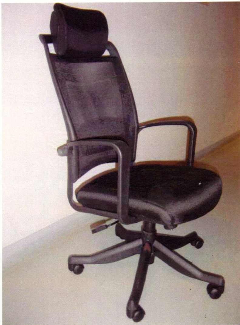
Fulkrum Office Chair