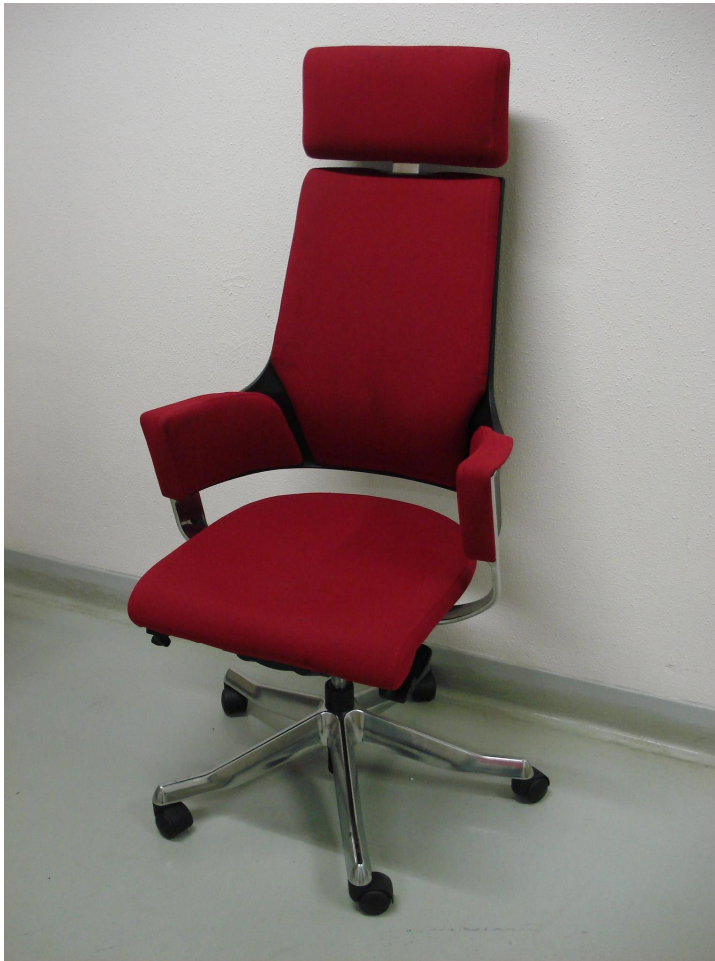
Photograph 1 : Delphi

A handwritten signature in black ink, appearing to be 'on le'.